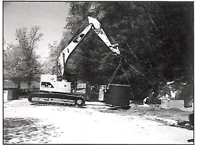
Wet well being set for the new Seahurst Beach pump station

Construction activities within the park will continue throughout the summer, and parking impacts should be expected. Work crews will be keeping park use impacts to a minimum through well marked construction zones and traffic safety practices. Normal construction work is scheduled Monday through Friday 7:00-4:00.