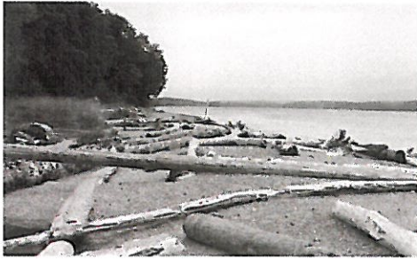
"Dedicated to Preserve the Purity of Your Environment"