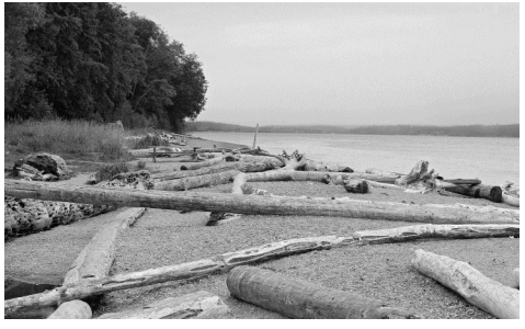
"Dedicated to Preserve the Furity of Your Environment"