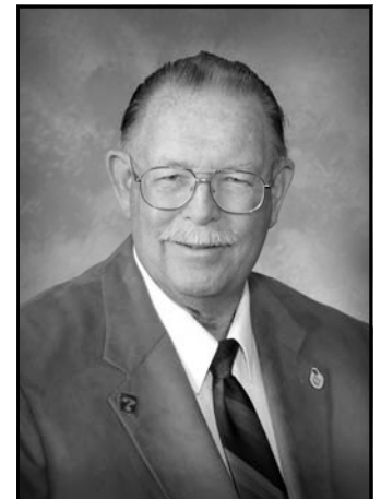
Commissioner Bill Tracy

Overall, we remain committed to serving you and maintaining your system, district-wide!