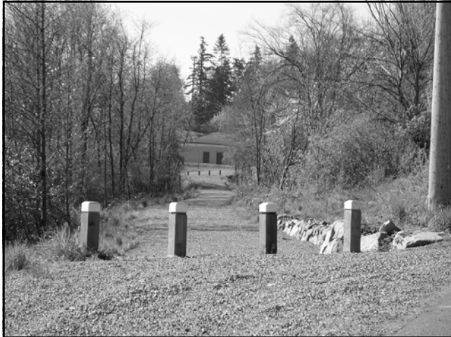
The new pedestrian pathway running between Des Moines Memorial Drive and South 176th Street is shown above.